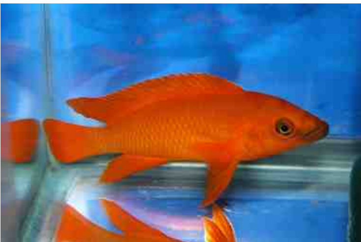
Leleupi in the show

The fee was very low at $25 if you registered early, otherwise it was $28. There were options for a convention T-Shirt and membership in the OCA. Hotel rooms were negotiated with the convention host Holiday Inn to be $67 per night, and you could split the cost with another convention attendee. Registration for the convention was done online with payment via PayPal. Phoning the Holiday Inn and booking the room at the OCA rate was very easy.