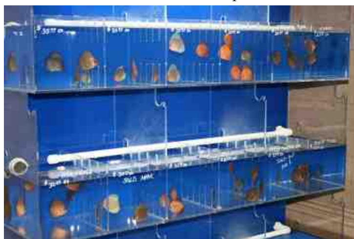
A rack of discus for sale