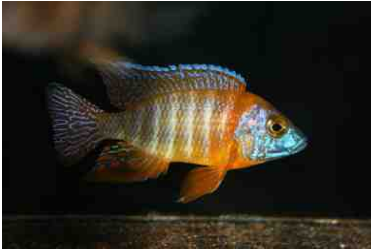
Peacock at Aquatica

After the auction was over, we got our fish settled in our room. We did partial water changes on the prior purchases, then we went down the road to Applebee's for a nice dinner and dessert. It was a good time to wind down after a whirlwind weekend of presentations, constantly checking room vendor's stock and prices, bidding in two auctions and visiting three local shops.