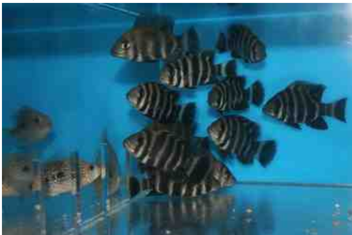
Cichlids for sale

Soon, we were on our way again. As we approached Buffalo, there was no traffic slowdown this year. However, at the border, there were far