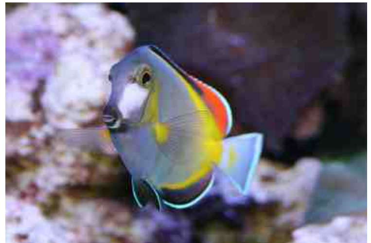
Friendly marine fish at RMS

I highly recommend attending an out of town convention. As a tropical fish hobbyist, it gives you many opportunities to meet fellow fish keepers and presenters from the US, Canada and even Europe. You will see species of fish that you don't see at home and you might learn something new at the speaker presentations.