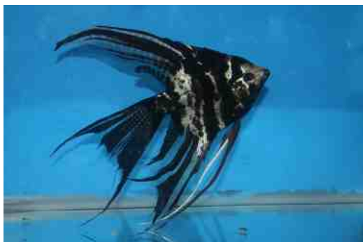
Angel fish in Show

At the end of the last presentation, we made our way to the Hospitality Suite to chat with other