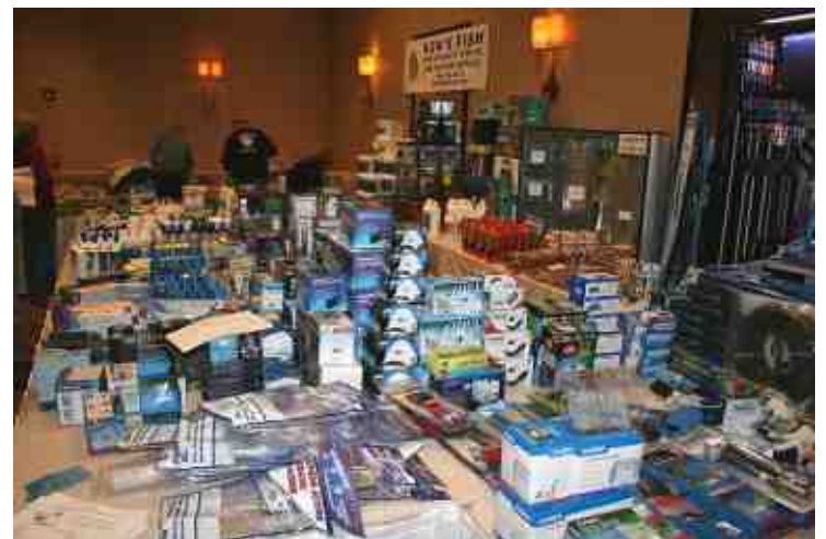
Vendor Ken's Fish displays items for sale

auction began. In this auction, only cichlids, catfish and plants were allowed, no dry goods or other species of fish. The split was the first $1 to the OCA, and of the remainder, 70% to the seller, 30% to the OCA. This was to encourage people not