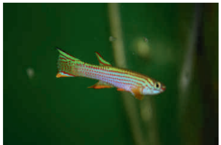
Aphyosemion Striatum (Five-Banded Killie) comes

Chromaphyosemion poliaki is a beautiful fish that comes from South West Cameroon in Africa. It is found in higher elevations on the eastern slopes of Mount Cameroon and prefers cooler waters. It is written that this peaceful fish prefers living in the upper areas of a well lit, planted aquarium. Males can be aggressive with its own kind so they are best kept in trios, rather than pairs. Of course, I lost my female so I am in need of some! The males are more colourful and I think I have the strain known as Mile 29 which refers to the location it is found. It is an easy first killifish with a good lifespan of 5 years.