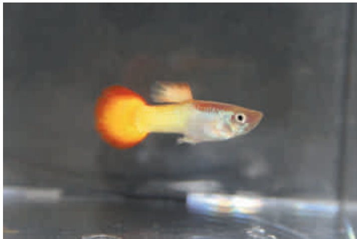
This month's jar show was all about Livebearers with an emphasis on Guppies above: Tequila Sunrise Guppy below: Pineapple Swordtail