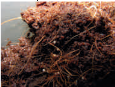
White Worm egg cysts

Anyway, the population exploded. At this juncture I had been waiting for 6 weeks for the culture to come to the point that I could use them for food. I placed a piece of plastic wrap over the top of the soil after sprinkling on some flake. I waited 24 hours and then returned to view my 'catch'. Nothing. Now I know there are thousands of worms in that box. The accepted method of catching them is to lay something on top of the soil in the expectation that the worms will climb onto the bottom in their search for food. Then you just wipe them off. Sure. My next step was to lift out a one inch section of coir