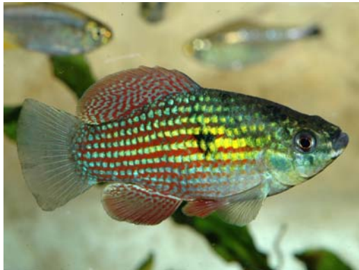
Florida Flag Fish . . . photo by MFJacobs 2008