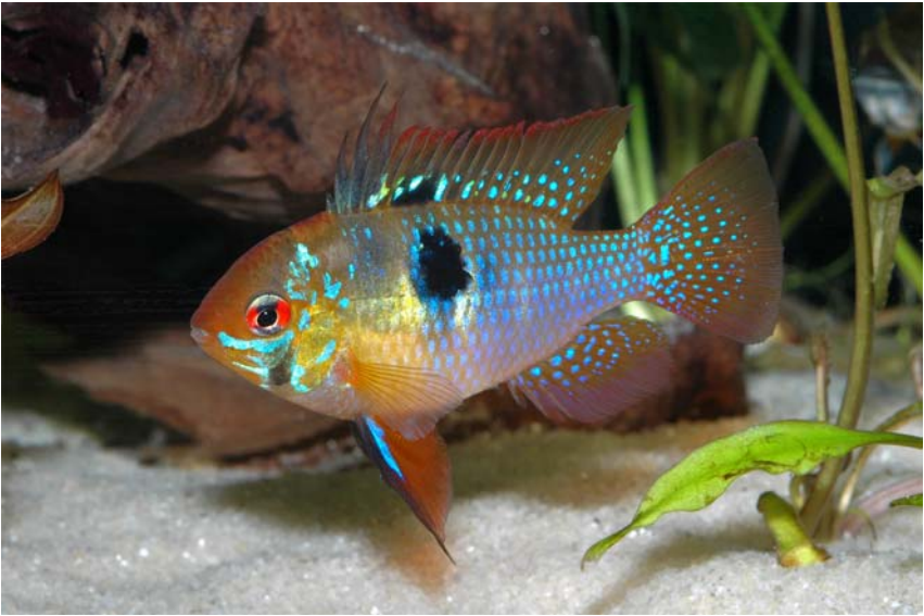
Microgeophagus ramirezi.. The RAM..