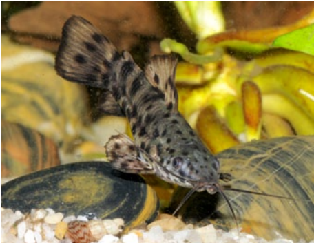
Tanja's Hoplo Cat

The Raphaels are rousted out of their caves once a month to make sure they are not stuck. I spent about 6 hours cutting one out of a decoration. Then she spent four months in rehab.