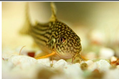
Sterbai Catfish, Corydoras sterbai . . . Photo by Nan Smith 2011