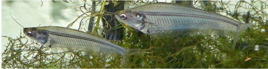
Tanja's Ghost (Glass) Catfish . . . photo by Tanja Diederich 2011

with a flashlight after lights out). If you give your ghost catfish a group of 6, you will see them more often, especially if you give them some plants for cover. Mine live in a group of three species, but they don't seem to mind and do synchronized tail-swishing. And even